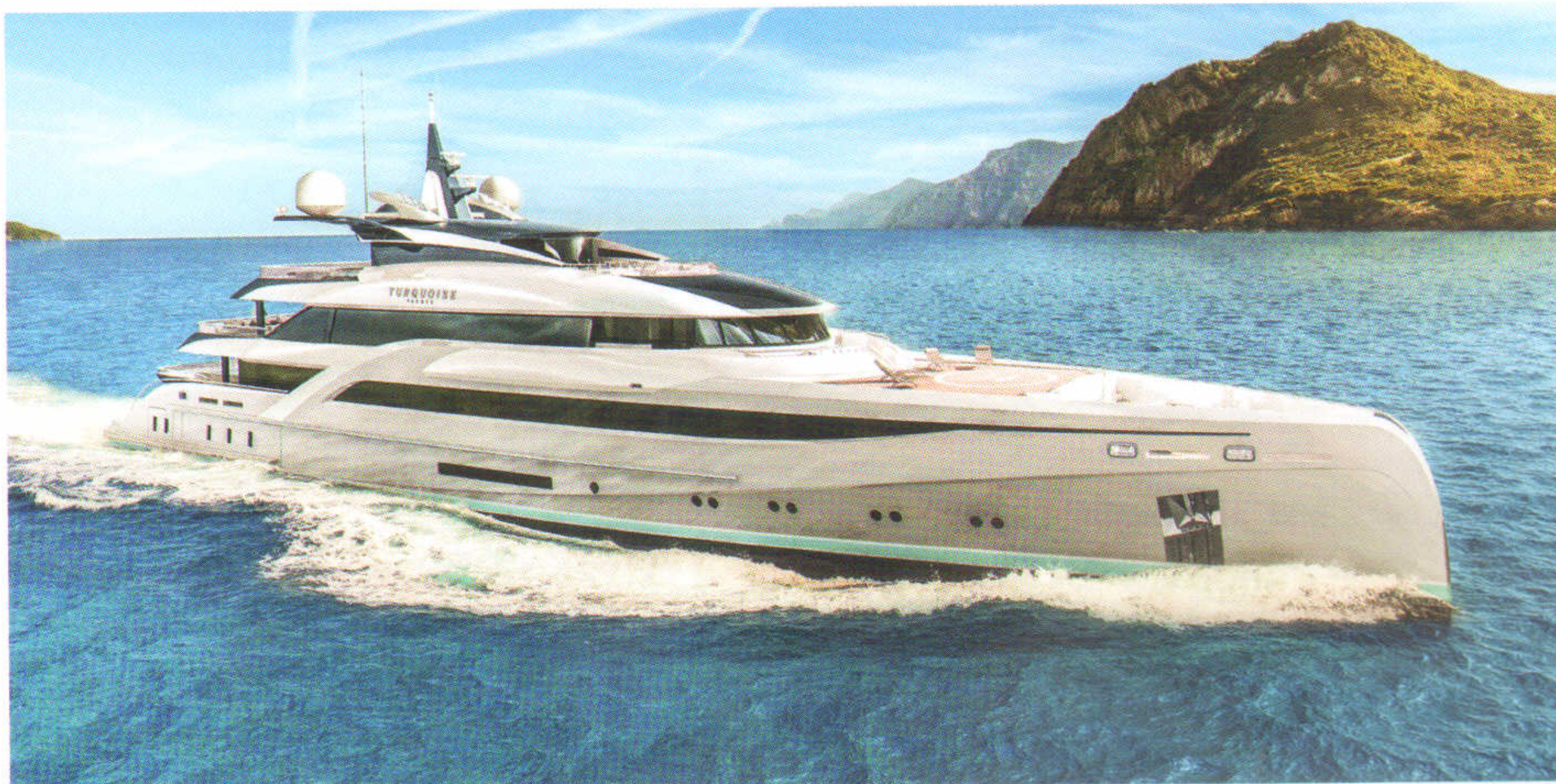
A new Turquoise look: 66 striking Nuvolari-Lenard metres.